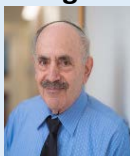
Robert A. Weinberg

16:30 Malignant Progression and Metastasis